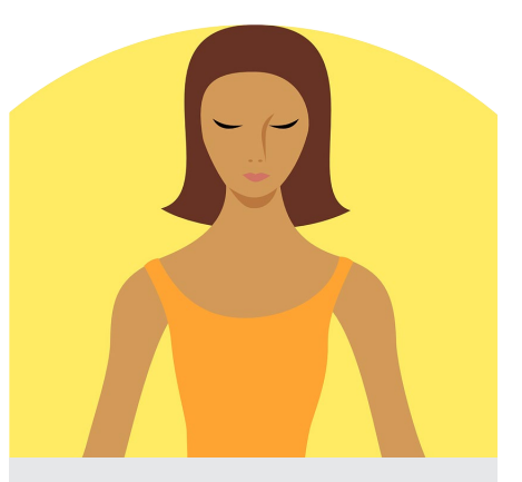
Page 12 — The Importance of Emotional Wellbeing