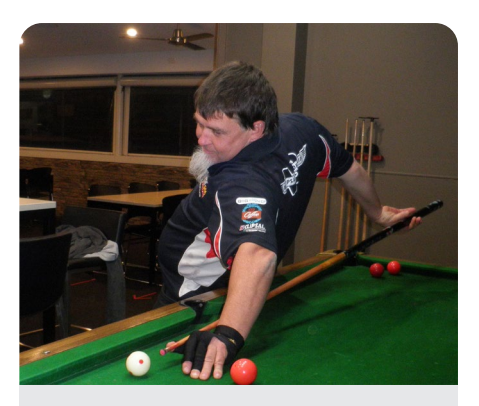
Page 9 — Client Social Group Activities in the Murraylands